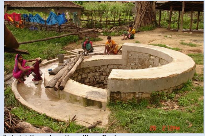
Babulal Oraon's well at village Darkana

In the present appraisal study, we visited 6 wells in total. The schemes were mostly undertaken from the year 2007-08. The wells are constructed to meet the requirement of drinking water as well as irrigation. The status of the schemes