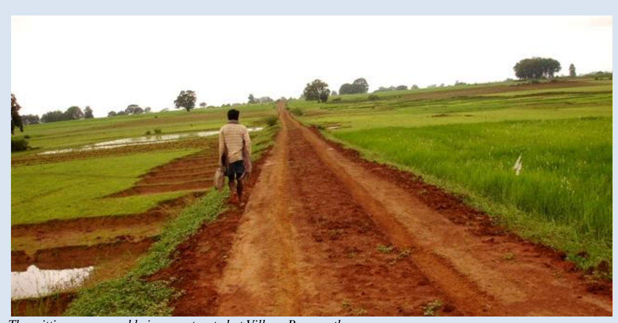
The mitti murram road being constructed at Village Besnapath