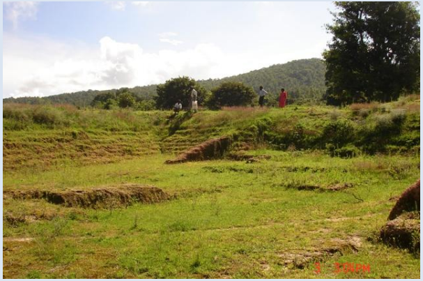
Incomplete ponds, at village Kurumgarh (left) and Roghadih (right)