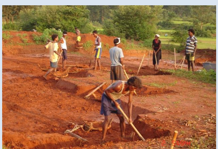
Ongoing pond construction at village Silphari

technically feasible for pond construction.