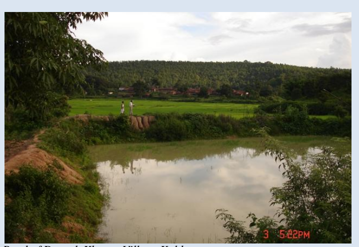
Pond of Deepak Khes at Village Kalda

Out of the two Bunds proposed for construction. one at village Gram Panchayat -Dahudadgaon, Malam is planned for the year 2009 -10, while at the other site in village Besnapat, Gram Panchayat- Janawal information there is no to the community about the scheme planned