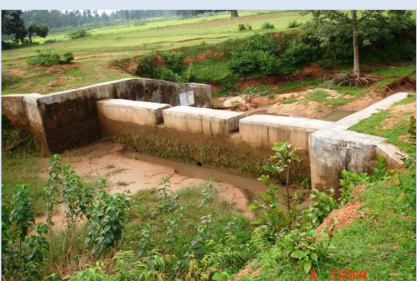
Different views of the check dam constructed at Chhattarpur